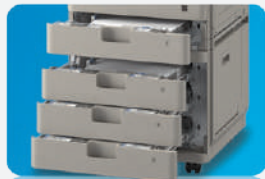
Easy Paper Access