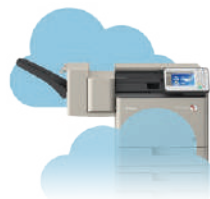
imageRUNNER ADVANCE C350P model shown.

Through its Life Cycle Assessment (LCA) System, Canon has lowered CO 2 emissions by focusing on each stage of the product life cycle, including manufacturing, energy use, and logistics. These products are designed with less packaging to be small and light with high performance. They're intended to help make transportation more efficient.