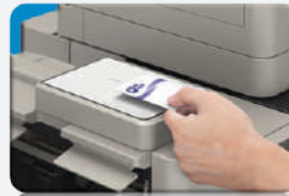
Contactless Card Reader